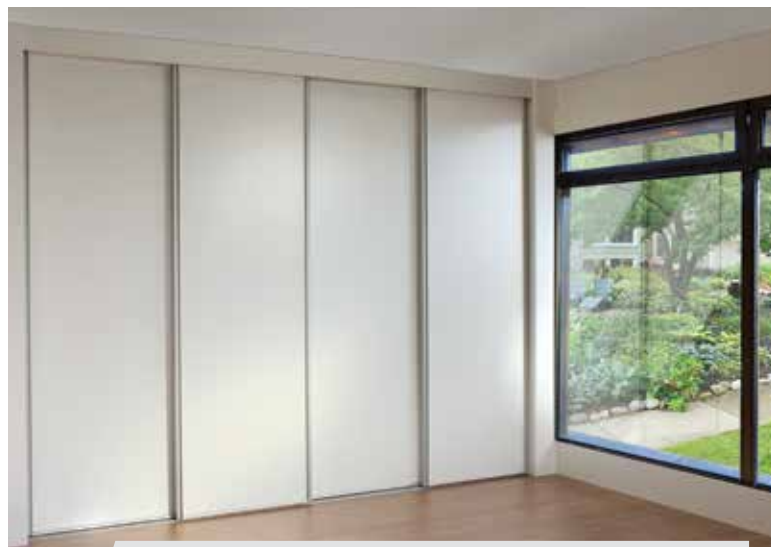
Standard 640 mm sliding doors used on this wardrobe

Customised internals made to your requirements. Contact us for more information