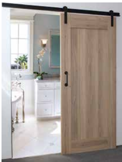
Single Barn Door