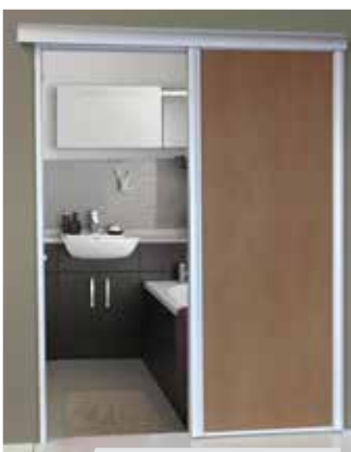
■ Alfa Sliding Door

■ Wide range of colours and finishes available. Contact us for information