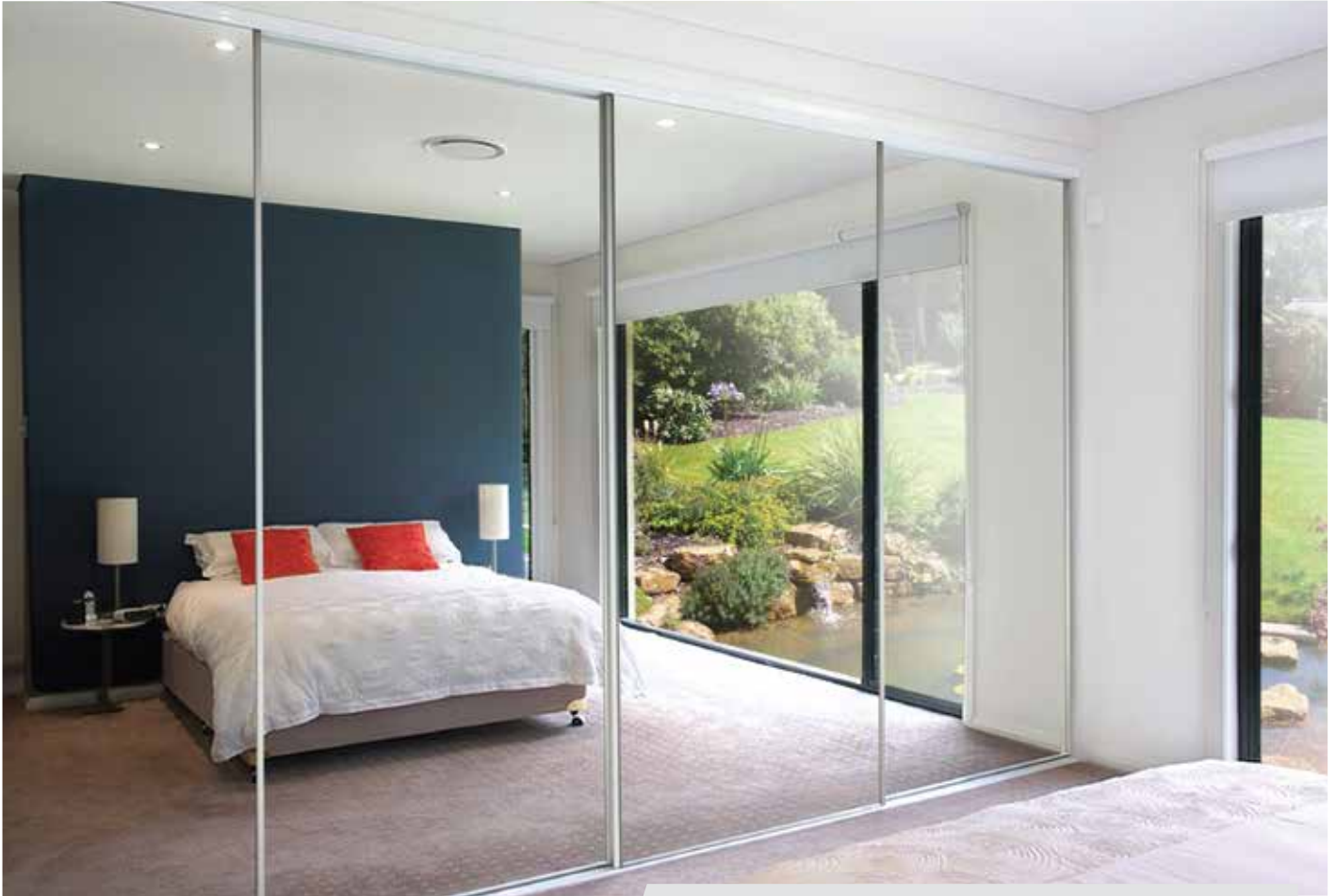
Convert your existing wardrobe by easily installing sliding doors

Modernise your home with easy to install sliding wardrobe doors