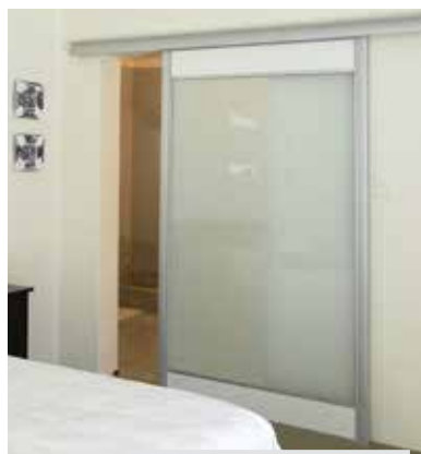
■ Large frosted glass

Double sided mirror; or mirror one side, woodgrain the other