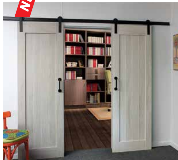
Double Barn Doors